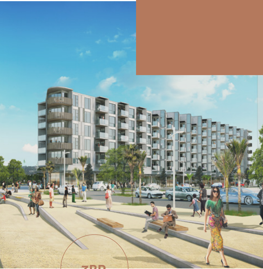
Fig. 01 Image Fig. 02 Layout 1 Floor plan of layout option one Fig. 03 Layout 2 Floor plan of layout option two